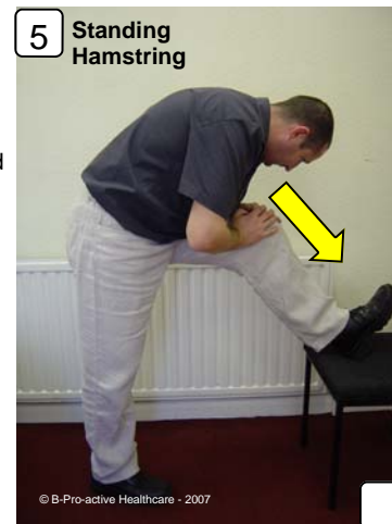
5 Standing Hamstring From the lunge position, lean back, rest your heel on the seat pan. Go into the reversed lunge by keeping the knee bent and bending forward. Feel a gentle stretch and hold for the allotted time. Change to the opposite leg and repeat for the other side.