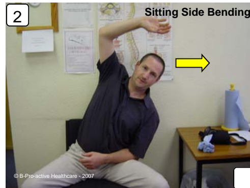
2 Sitting Side Bending Sitting upright, rest your elbow on your thigh as shown and lean on it as you side bend. Use your opposite arm as a lever to get a greater stretch. Repeat for opposite side.