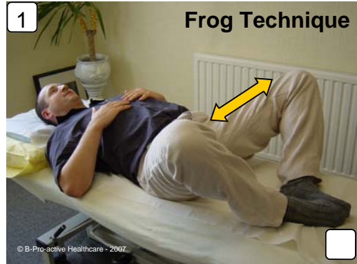
Put a pillow underneath your head. Lying on your back, bend knees up, drop knees out to the side bring the soles of your feet together.