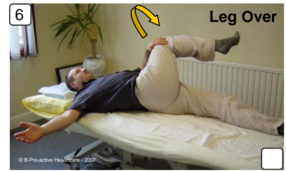
Bend knee up to 90°, with the hip at 90°. Place right arm out to balance and bring the left across and hold the knee as shown. Gently pull the knee over. Repeat for left.