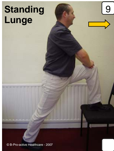
Standing half a meter from the chair, place foot in the middle of the seat pan. Place hands on the knee for support. Gently lean forward. Keep your body upright, looking straight ahead and hold for the allotted time. Feel a gentle stretch with no pain.