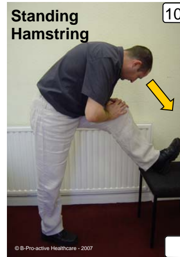
From the lunge position, lean back, rest your heel on the seat pan. Go into the reversed lunge by keeping the knee bent and bending forward. Feel a gentle stretch and hold for the allotted time. Change to the opposite leg and repeat for the other side.

Remember, No Pain and No Bouncing as you stretch!!!!