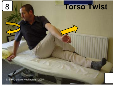
Place both hands behind in sitting position. Bend leg up and cross ankle over the opposite knee as shown. Place opposite arm on the bent knee and rotate and push with the elbow at the same time