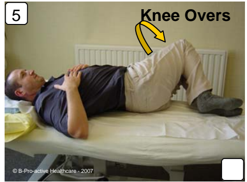
Bend both knees up. With ankles and knees held together, drop both legs to the left and hold. Repeat for the right.