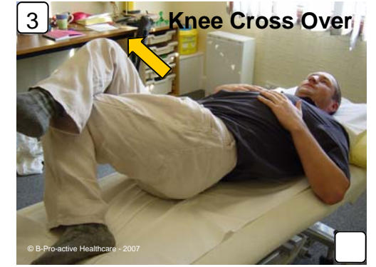
From the ankle cross over position, slide the ankle over until one knee crosses the other. The knee on top is the lever to take the other knee over as shown. Repeat for opposite side.