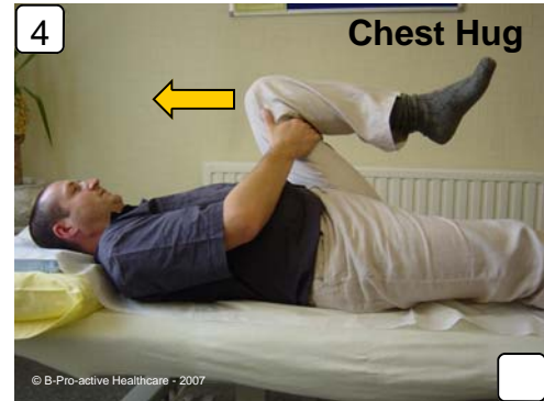
Bend your knee up. Grasp behind the knee as shown and pull back towards your chest, letting your shoulders relax. Repeat for the opposite side.