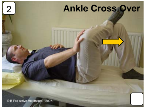
Take your ankle and rest it on the opposite knee. Place your hand on your knee and gently push.